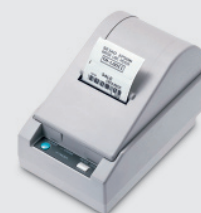
TM-L60 II Label printer

For further information please contact your local Epson office or visit www.epson-europe.com