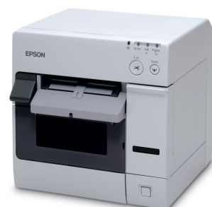
TM-C3400 colour label printer

Besides a large product range of inkjet printers, Epson also offers thermal label printers for the commercial trade and service sectors.