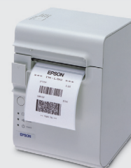
TM-L90 Label printer

Besides a large product range of inkjet printers, Epson also offers thermal label printers for the commercial trade and service sectors.