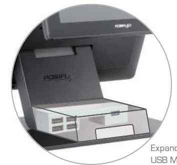
Expandable USB Module

A unique cabling system (I/O expansion are centralized and hidden in the rear cover) delivers a truly clutter-free station. The standard base can house the optional PoweredUSB module or USB extension module. There is no need to change to a larger base, while retaining the sleek look.